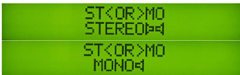
Diagram 9 - the sound channel setting interface